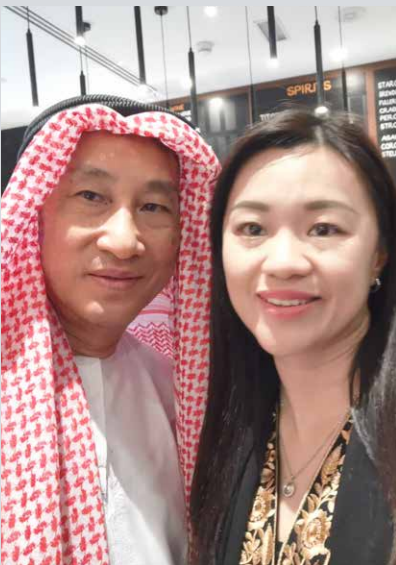
BE Lifestyle Travel to Dubai