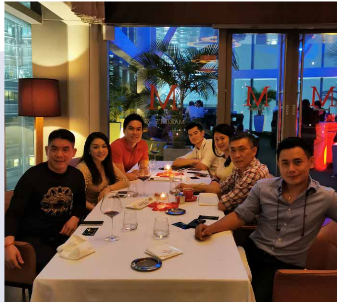
Dinner with upline & founders