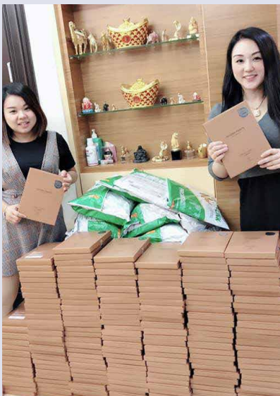
I love Hulora Pants