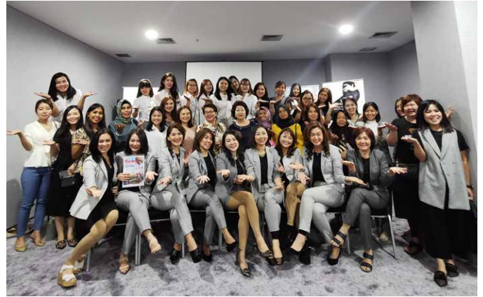
Attended Recognition night

"I'm an empowered woman now. I freely talk about my future and dreams with people around me. I have learned to look at the bigger picture and see things from different perspectives."