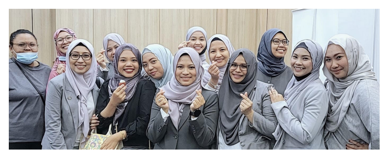
Teamwork makes the dreams work

To Mardiana, challenges are vital for growth; facing and learning how to navigate them will build resilience. Success will come eventually when we overcome these obstacles and learn from them.