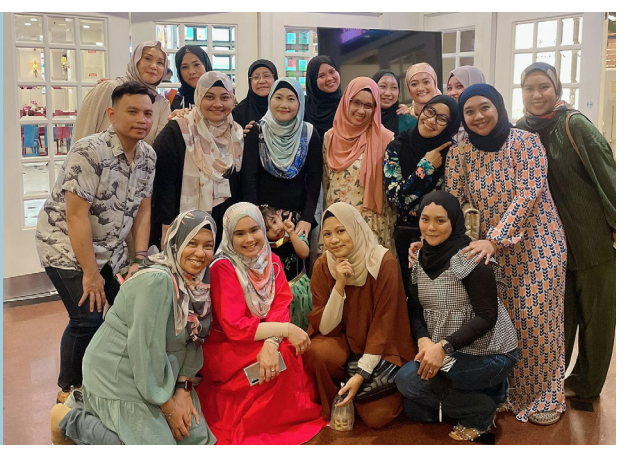
With my tribe who has stuck with me through thick and thin

"Remember YOLO — 'you only live once' — so make the best out of life! IF YOU THINK YOU CAN, YOU CAN. This is the easiest motto to remember and it's my greatest butt-kicker whenever I feel lousy!" she concluded.