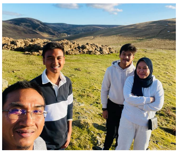
Family holiday in Edinburgh