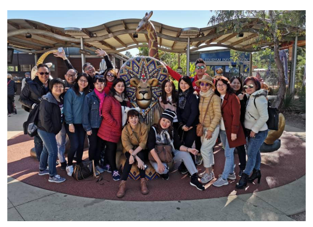
BE Lifestyle Campaign to Melbourne