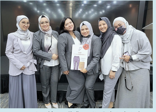
Award for my Challenger List, Exclusive limited pants