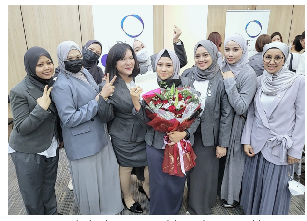
Received a big bouquet to celebrate the memorable moment on the day I became RCCA