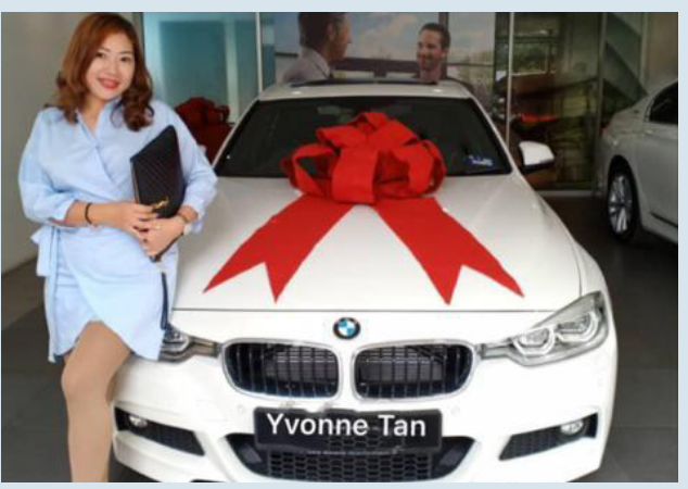
My very first BMW

As a housewife of many years, she knew that women needed to have their own source of income. After realizing the miraculous power of