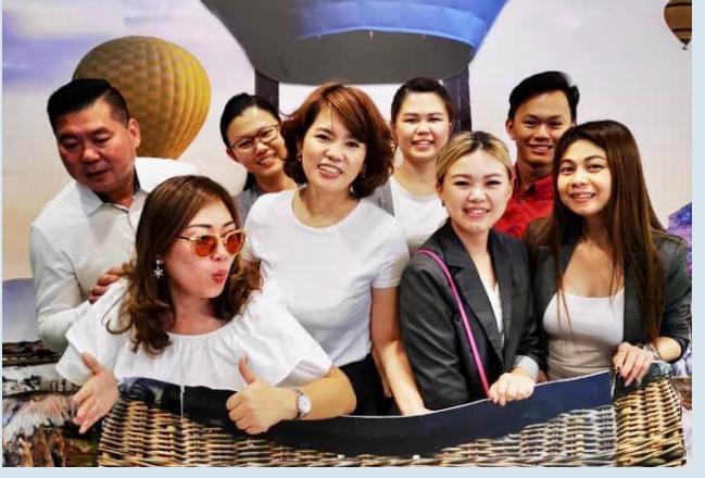
Fighting together to qualify for BE Lifestyle to Turkey